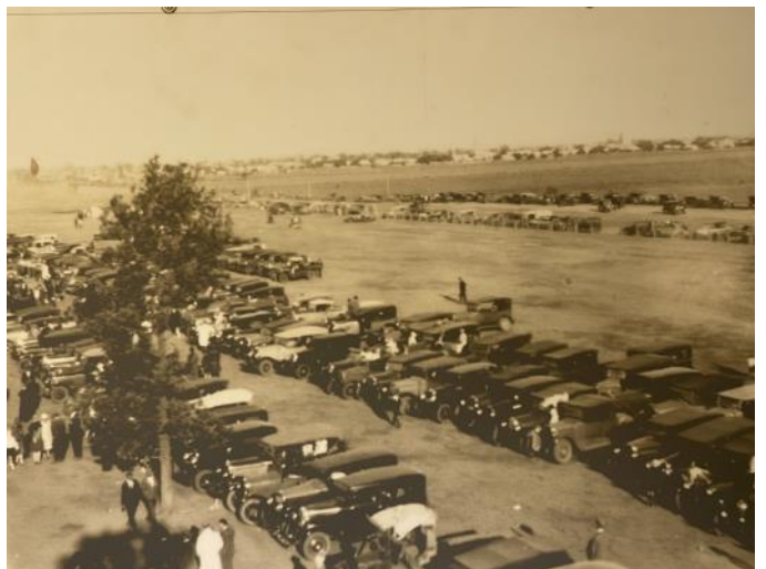
Above Right—5th April 1930. Hundreds of cars line the road during the first Narromine Air Pageant, which features 21 aircraft and attracts 9,000 paying spectators over the weekend.