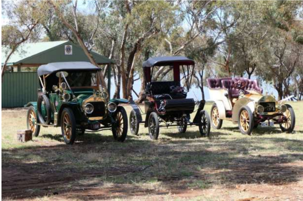
1909 Minerva, 1903 Oldsmobile & 1907 Darracq at the lake