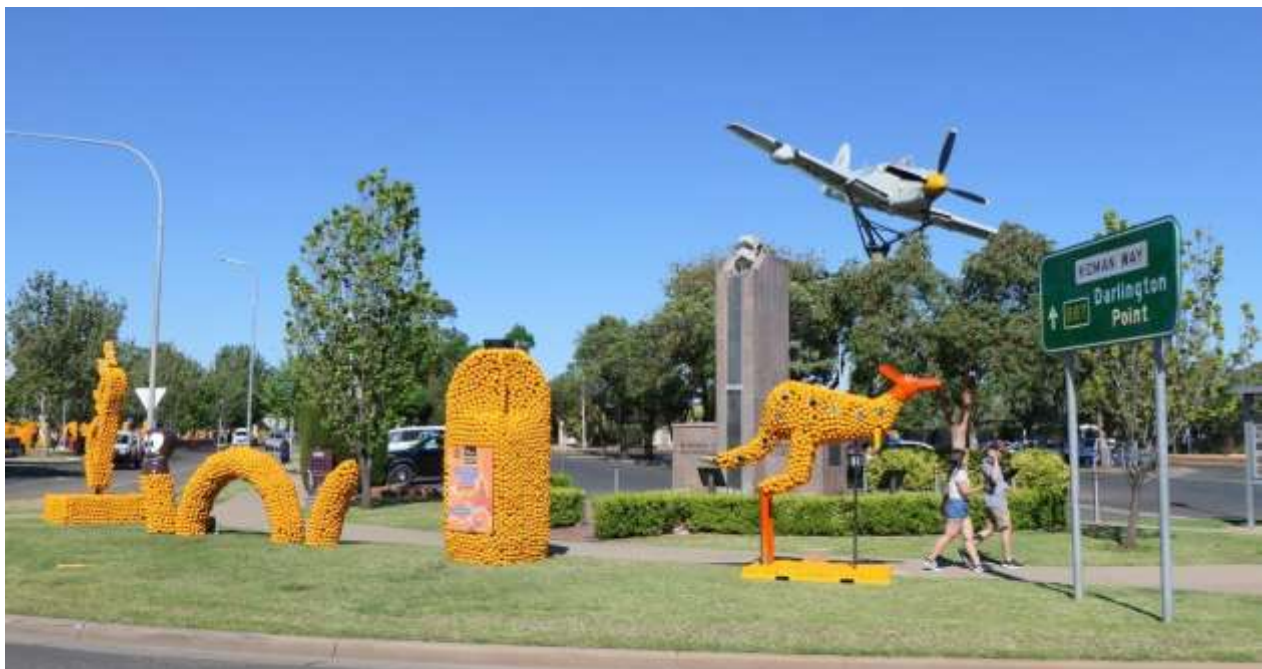
Some of the Citrus Festival 'sculptures'

Pack and load up time for our final day. The extensive Griffith Citrus Sculptures set up overnight in 4 blocks of the main street, Banna Ave, were quite spectacular. The wire support frames, in various shapes and sizes, were covered with 1000's of Valencia oranges which, at the end of the festival are juiced.