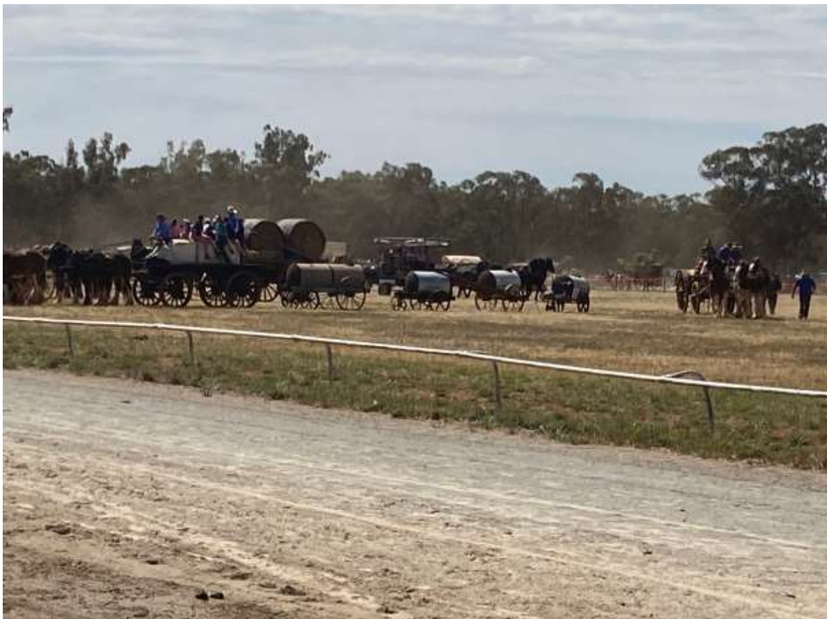
A team of 7 draft horses hauling 4 Furphy water tanks at Barellan

For some of our entrants, their participation began at Barellan which showcased various forms of pre-motorised vehicles with wagons pulled by teams of bullocks, horses, camels, donkeys, and even goats. The all-in procession really was a spectacle, which was also joined by a couple of our entrants in their Renault AX and Model T Ford.