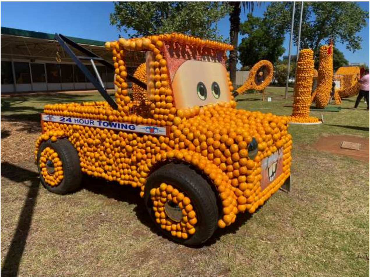
Some of the Citrus Festival 'sculptures'