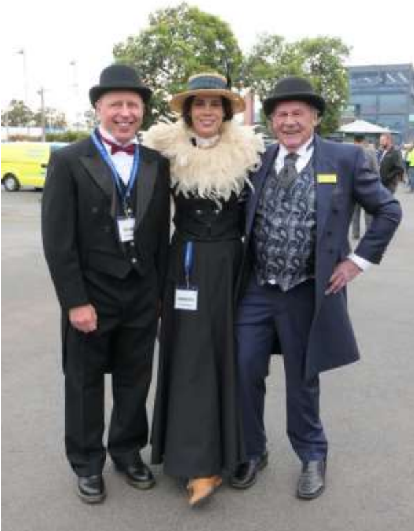
Team FN in their FiNery

In the evening, the much anticipated gas light procession around Griffiths central Banna Ave headed off at sunset and was quite a spectacle, with lights visible on the majority of our vehicles and observed by what seemed to be half the Griffith population. Whiffs of kerosene from the lit-up tail and side-lights, coupled with exhaust smoke, popping engines and some very, elaborately costumed drivers and passengers created a fun spectacle.