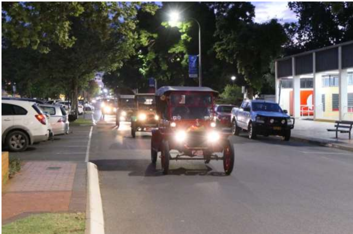
Ford T's lighting the way

The rest of us 'went modern' with our lighting, with various arrangements of battery powered LED globes and deftly hidden bicycle lights. What a great inclusion in the rally, and 'hats off' to the local authorities who sanctioned it, and to those who participated.