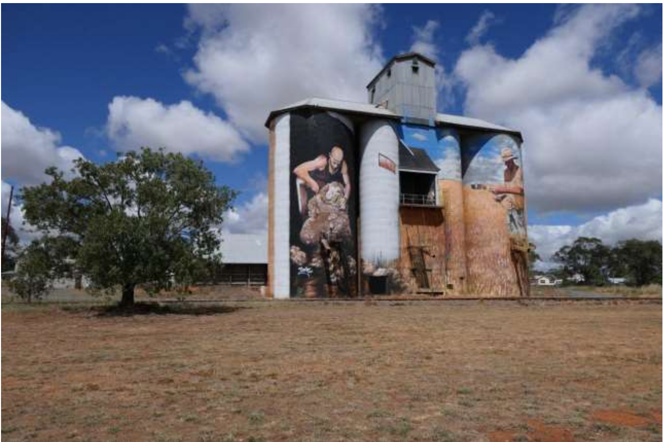
Silo Art at Weethalle