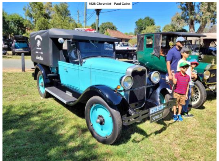
1928 Chevrolet - Paul Cains