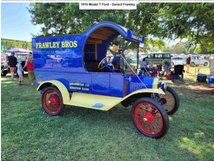
1915 Model T Ford - Gerard Frawley