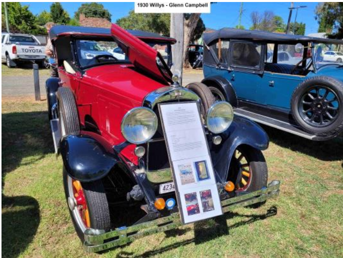
1930 Willys - Glenn Campbell