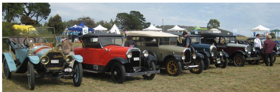
Above - Club cars at Mugga Mugga