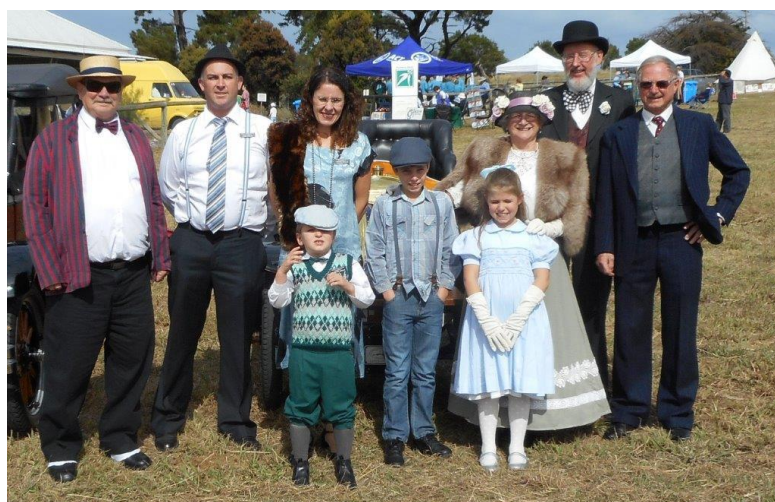
Above - An Impressive gathering of members looking fantastic in period dress.