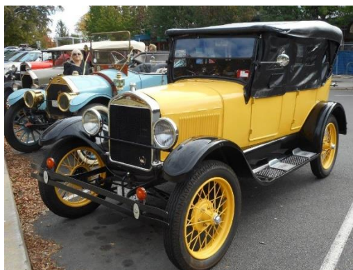
Left - Laurie Smith's T Model