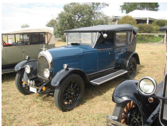
Left – The classy Sturgess Bean