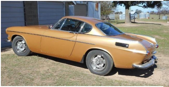
Even 'The Saint' attended