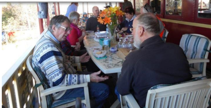
Above left – Who put this @^#@ hood on top of the boot!