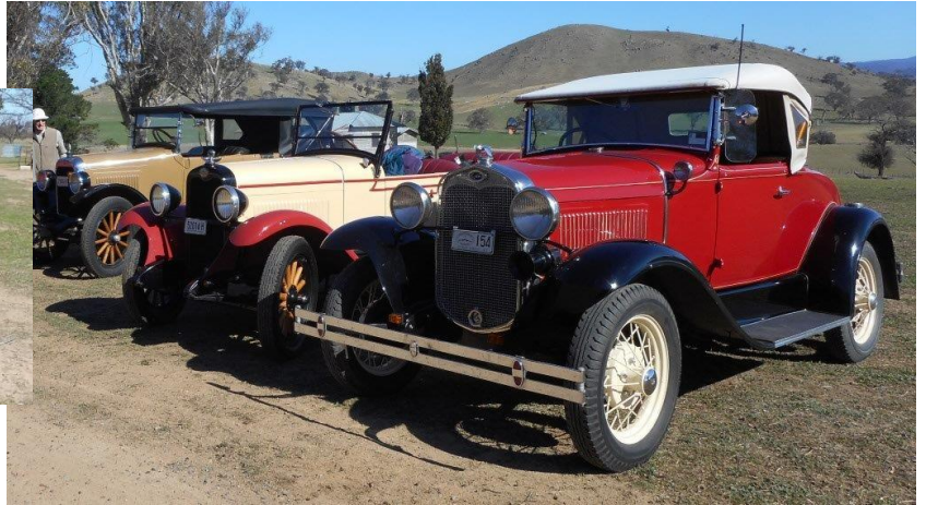
Above - Some classic Yankee black iron - The Young Ford and Cadona Chevy.