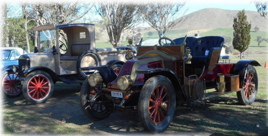
Left – The sporty Southwell Renault and the T hack.