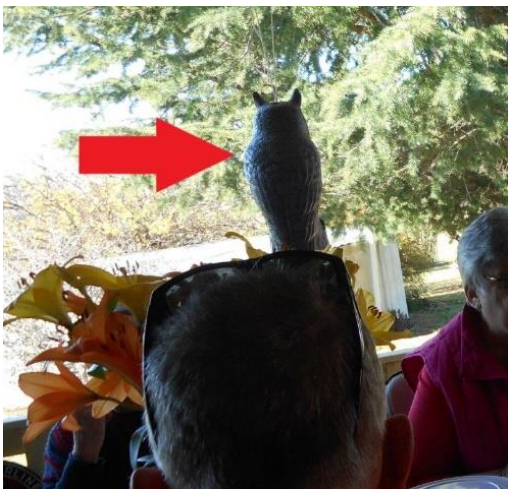
Left – From page 4 - Yes, now you see it don't you! Next we'll see Greg sitting permanently in the lotus position on top of a mountain!