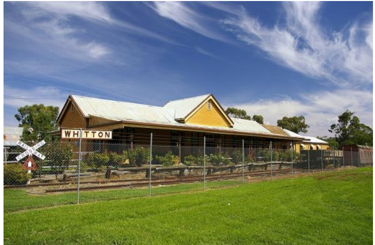
Above: Railway station building at the Whitton Museum

Whitton today supports several Agribusiness manufacturing business such as Southern Cotton's Cotton gin and Voyager Malt's craft Malt production facility, as well as a regional tourist attraction, the Whitton Malt House that was opened in late 2020.