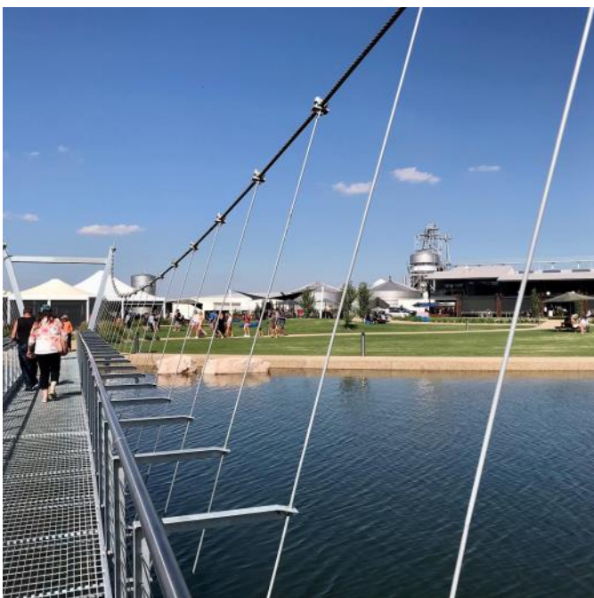
Below: Photos of Whitton Malt House